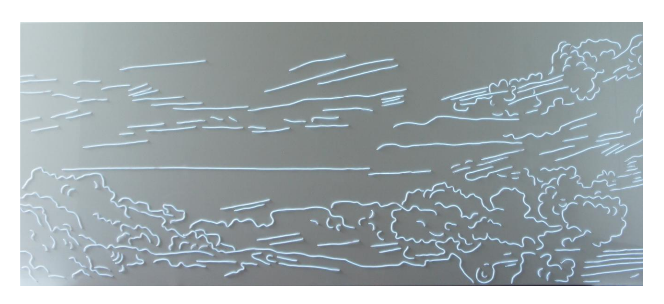
Jonathan Thomson EL 016 KW5 2011 Electroluminescent Wire on Aluminium Panel 80 x 200 x 5 cm