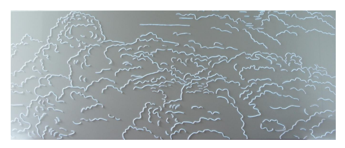
Jonathan Thomson EL 016 KW3 2011 Electroluminescent Wire on Aluminium Panel 80 x 200 x 5 cm